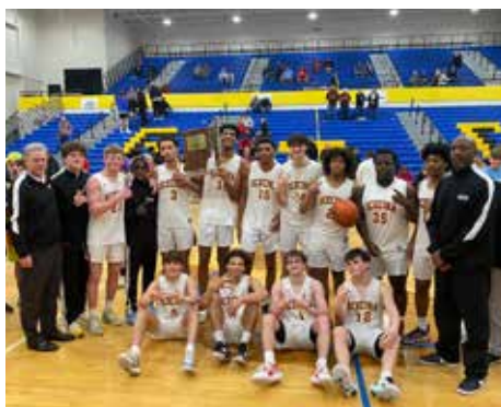
Boys basketball regional champs