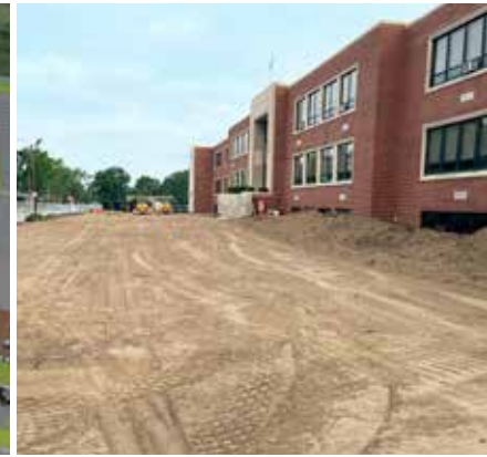
Left: Phase 1 work included demolition of the baseball field dugout; Center: Architect's rendering of the athletic fields and front entrance; Right: Phase 2 involved earthwork on the front entrance.

Seccina Memorial High School's largest construction project in history is underway, marking the final construction project of the Our Faith, Our Journey, Our Time capital campaign.